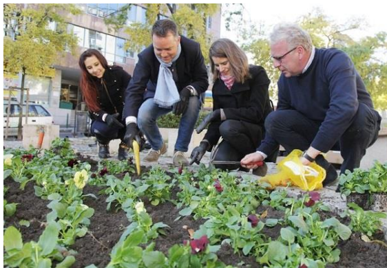
Planting at Királyhágó tér

In 2015 together with CBRE we donated clothes as well as 240,000 HUF with the aim to support outside activities, summer vacation and other excursions. Moreover, we organized a tulip planting with the children in the fall. The management's and the staff's motivation, care and commitment to these children always makes a deep impression on us. For more information about their activities please visit their website: http://szent-miklos-iskola.webnode.hu/